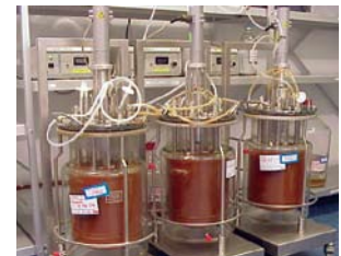
Figure 2—Quality cannot be tested into a product. It must be included during development, built in during manufacture, and provided in follow-up support.