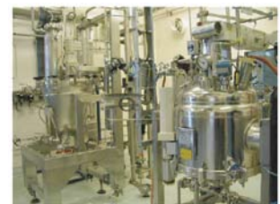
Figure 3—World-class manufacturing capabilities. The production facilities are flexible and will meet your regulatory requirements.