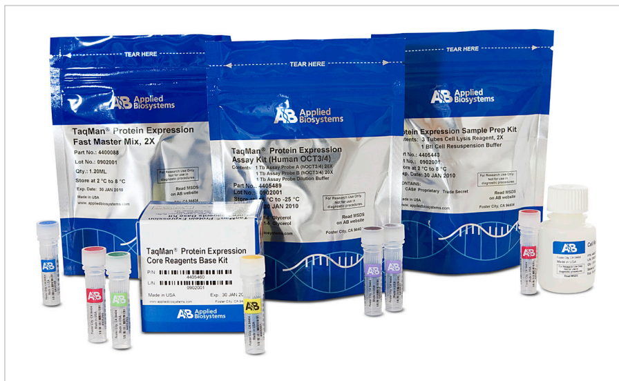
Figure 1. The new TaqMan® Protein Expression Assays family helps provide fast and easy identification and relative quantification of protein markers from limited quantities of cultured human embryonic stem cells.

Flexibility —expands beyond RNA to protein using the same instrument platform