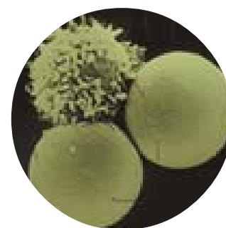
Fig. 1. Human CD4+ cell bound to two Dynabeads® CD4. (Dr H Ping Ting-Beall).

Human Embryonic Kidney (HEK) 293 cells were transiently transfected with different ratios of GluR1 and GluR2(R) cDNAs. The subunit specific cDNAs on separate CDM-8 plasmids were co-transfected with the cDNA for the lymphocyte surface antigen CD8 in a 4:1 ratio. Transiently transfected cells were isolated using immunomagnetic Dynabeads® pre-coated with a monoclonal human anti-CD8 antibody and used in electrophysiological, biochemical and imaging studies (2).