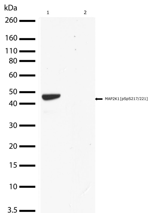
Figure 1 Western blot analysis of ABfinity™ MAP2K1 [pSpS217/221] Recombinant Rabbit Monoclonal Antibody (Cat. no. 701267).

Caution: Sodium azide is an extremely toxic and dangerous compound particularly when combined with acids or metals. Properly dispose of solutions containing sodium azide.