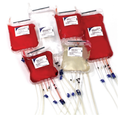
Figure 1—Choose your prefilled GIBCO® formulation. GIBCO® universal bags are available prefilled with a selection of GIBCO® media and reagents, in 5 L and 10 L sizes.

maximize your results, GIBCO® universal bags are designed with universal tubing connections for easy integration into your automated cell maintenance systems. There's no need to wait four to six weeks for made-to-order bagged media. Just order your media products directly from Invitrogen, prefilled with 5 L or 10 L in a universal bag (Figure 1), with the formulation of your choice. Choose from a variety of stocked formulations including DMEM,