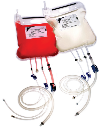
Figure 3—TrypLE™ Express, the gentle, room temperature-stable cell dissociation enzyme available in the GIBCO® universal bag format.