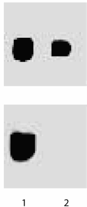
Western blotting for human FAK (pY397). Human endothelial cells were treated with 1 mM pervanadate, a general inhibitor of protein tyrosine phosphatases, for 15 minutes at 37°C then either left untreated (lane 1) or treated (lane 2) with 50 µg/ml alkaline phosphatase for 30 minutes at 37°C. The top panel was probed with mouse anti-FAK antibody (Cat. No. 610087) and the bottom was probed with the mouse anti-human FAK (pY397) antibody at a 1:1000 dilution. The target band in each panel may be observable in a range of 116-125 kD.

Focal Adhesion Kinase (FAK) is a cytoplasmic tyrosine kinase that colocalizes with integrins in focal adhesions. This cellular localization is directed by a 125 amino acid sequence at the C-terminus called "Focal Adhesion Targeting" sequence (FAT). The binding of extracellular matrix ligands to integrins triggers autophosphorylation at Tyr-397, and activation of FAK through phosphorylation of Tyr residues (Tyr-576 and Tyr-577) in the kinase domain activation loop. For example, cell adhesion to a fibronectin substratum involves concurrent activation of Src and phosphorylation of the FAK activation loop. In addition, phosphorylation of other Tyr residues (Tyr-925 and Tyr-861) creates binding sites for SH2 domains of intracellular signaling molecules such as Src, PI3 kinase, and Grb2. FAK's ability to bind numerous structural and signaling proteins via a variety of interactions is important for FAK activation level and for FAK interaction with a variety of substrates localized to sites of cell adhesion. Thus, FAK activity is regulated by a complex set of phosphorylation sites, and this phospho-regulation could be important for cell motility, cell growth, cytoskeletal organization and adhesion-dependent cell survival.