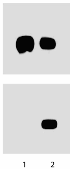
A431 cells were either left untreated (left lane) or treated (right lane) with 100 ng/ml EGF for 5 minutes at 37°C. The top panel was probed with Stat3 (Cat. No. 610189) and the bottom was probed with Stat3 (pS727) (Cat. No. 612543). Lane 1: 1:250, lane 2: 1:500 dilution of the mouse anti-Stat3 antibody.

The 49/p-Stat3 monoclonal antibody recognizes the S727-phosphorylated form of Stat3 (isoform 1). The fluorochrome-conjugated formats have been evaluated using a human model system. However, the unconjugated form of this antibody (Cat. no. 612542 or 612543) is also effective for western blot analysis of human, mouse, and rat tissue.