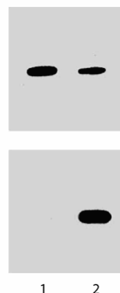
Human Endothelial cells were either untreated (left column) or treated with (right column) IL-4 (10 ng/ml) for 1 hour at 37°C. The top panel was probed with Stat6 (Cat. No. 611290) and the bottom panel was probed with Stat6 (pY641) (Cat. No. 611820).