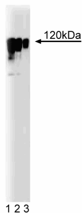
Western blot analysis of Eg5 on a human endothelial cell lysate. Lane 1: 1:1000, lane 2: 1:2000, lane 3: 1:4000 dilution of the anti-human Eg5 antibody.

This antibody is routinely tested by western blot analysis. Other applications were tested at BD Biosciences Pharmingen during antibody development only or reported in the literature.