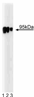
Western blot analysis of HIF-1 \beta /ARNT1 on Jurkat cell lysate. Lane 1: 1:1000, lane 2: 1:2000, lane 3: 1:4000 dilution of the Mouse Anti- HIF-1 \beta antibody.

The Ah-receptor (AHR) is a ligand activated transcription factor that mediates the biological effects of agonists. AHR dimerizes with a structurally related protein known as ARNT (arylhydrocarbon-receptor nuclear transducer). This heterodimer binds enhancer elements and induces the expression of target genes, specifically those involved in the metabolism of xenobiotics. ARNT1 and ARNT2 are members of the basic-helix-loop-helix-PAS family of heterodimeric transcription factors, which also includes AHR, hypoxia-inducible factor-1 \alpha (HIF-1 \alpha ), and the Drosophila single-minded protein (Sim). While ARNT2 expression is limited to brain and kidney, ARNT1 exhibits ubiquitous expression. A targeted disruption of the Arnt locus in the mouse yields embryonic stem cells that fail to activate genes that normally respond to low oxygen tension. Arnt -/- embryos do not survive and show defective angiogenesis of the yolk sac and branchial arches, stunted development, and wasting. Thus, in addition to its regulation of xenobiotic metabolism genes, ARNT is thought to induce developmental gene expression resulting in vascularization of the developing embryo.