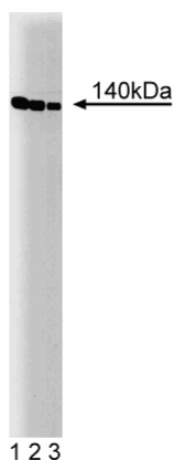
Western blot analysis of mDia1 on a RSV-3T3 cell lysate. Lane of 1: 1:500, lane 2: 1:1000, lane 3: 1:2000 dilution of the mouse anti-mDia1 antibody.

GTPases like Ras, Rho, cdc42Hs, and Rac modulate a multitude of cellular functions like cytoskeletal architecture, growth, motility, and gene expression. The activity of the GTP-binding proteins is regulated by factors that accelerate GTP-binding (GAPs) and proteins that enhance the rate of GTP hydrolysis. mDia1, also known as p140mDia and Drf1, is the mammalian homologue of Drosophila's diaphanous, a protein essential for cytokinesis. The 1255 amino acid mDia1 is widely expressed, with a Rho binding domain at the NH2-terminal region, a central polyproline region, and an FH2 domain. This protein also shares homology with the yeast Bn1p essential for budding and the mouse formin necessary for proper limb development. mDia1 binds to GTP-Rho and to the actin-binding protein profilin—all three proteins are co-localized at the lamellipodia in cultured cells. The overexpression of mDia1 promoted the formation of actin filaments, implicating this protein in cell motility events regulated by Rho. mDia1 was also found consistently mutated in familial deafness.