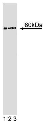
Western blot analysis of CIP4 on JAR cell lysate. Lane 1: 1:500, lane 2: 1:1000, lane 3: 1:2000 dilution of anti-CIP4 antibody.

This antibody is routinely tested by western blot analysis. Other applications were tested at BD Biosciences Pharmingen during antibody development only or reported in the literature.