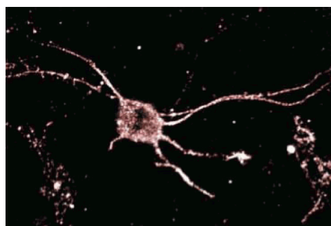
Immunofluorescence staining of rat neurons.