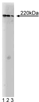
Western blot analysis of AKAP220 on Rat Brain lysate. Lane 1: 1:250, lane 2: 1: 500, lane 3: 1: 1000 dilution of anti-AKAP220.

The type II cAMP-dependent Protein Kinase (PKA) is compartmentalized within the cell. To maintain this localization of type II PKAs, the regulatory subunit (RII) interacts with RII-anchoring proteins. For instance, attachment of type II PKA to the cytoskeleton occurs through the binding of RII to microtubule associated-protein 2. In brain, several proteins have been identified as PKA type II anchoring proteins and form a family named AKAP (A-Kinase Anchor Proteins). AKAP220 is a protein of 1129 amino acids with a PKARII binding site and a CRL motif at the COOH terminus, characteristic of peroxisomal proteins. AKAP220 mRNA is expressed ubiquitously with the highest levels in testis and brain. Immunolocalization studies confirmed the peroxisomal distribution of both AKAP220 and PKARII in a cell line derived from rat Sertoli cells.