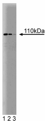
Western blot analysis of LRP on human endothelial lysate. Lane 1: 1:1000, lane 2: 1:2000, lane 3: 1:4000 dilution of LRP.

Drugs that selectively attack dividing cells are often used in cancer therapy. However, small cell populations do not die, but develop resistance to a variety of toxic drugs. Multidrug resistance is achieved by gene amplification of specific membrane-bound transport ATPases that shuttle the drugs out of cells. Some multidrug-resistant cancer cells express a protein of 110 kDa named LRP ( L ung R esistance-related P rotein). LRP expression might be an indicator of prognosis after chemotherapy in acute myeloid leukemia and ovarian carcinoma. The LRP gene encodes a protein of 896 amino acids with significant homology to the major vault protein from Dictyostelium discoideum . Although ubiquitously expressed, LRP is most abundant in epithelial cells.