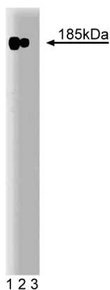
Western blot analysis ErbB2 on a A431 cell lysate (Human epithelial carcinoma; ATCC CRL-1555). Lane 1: 1:2500, lane 2: 1:5000, lane 3: 1:10,000 dilution of the Mouse Anti-Human ErbB2 antibody.

ErbB2 (Neu or Her-2) is a member of the erbB family of growth factor receptors. These factors possess constitutive tyrosine kinase activity and are commonly overexpressed in breast and ovarian carcinomas. While other erbB family members' ligands, such as EGF and NDF, are well characterized, a natural ligand for erbB2 remains unknown. ErbB2 forms heterodimers with erbB1/EGFR, erbB3, and erbB4, and can modulate their ligand affinities. Thus, erbB2 alters the intracellular responses elicited by EGF and NDF. This control is due to the fact that erbB2, when in complex with another erbB family receptor, decelerates the rate of ligand dissociation. Therefore, erbB2 may act as a signaling subunit for other receptors rather than a true growth factor receptor. Due to high sequence homology, this antibody may cross-react with the 180 kDa EGFR.