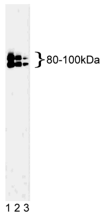
Western blot analysis of OPA1 on a K-562 cell lysate (Human bone marrow myelogenous leukemia; ATCC CCL-243). Lane 1: 1:500, lane 2: 1000, lane 3: 1: 2000 dilution of the mouse anti- OPA1 antibody.

This antibody is routinely tested by western blot analysis. Other applications were tested at BD Biosciences Pharmingen during antibody development only or reported in the literature.