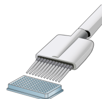
Plate cells one day before the transfection experiment so that cells will be approximately 75% confluent on the day of transfection.