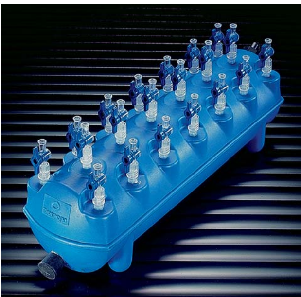
Figure 1. Vac-Man® Laboratory Vacuum Manifold.