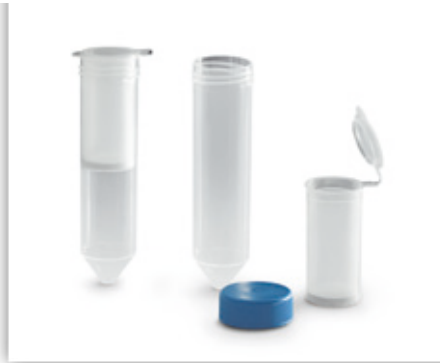
Vivapure® Maxi – 19|20 ml Binding capacities: 15–80 mg