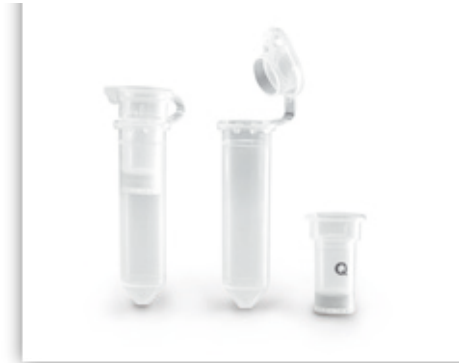
Vivapure® Mini – 400|500 µl Binding capacities: 1–4 mg